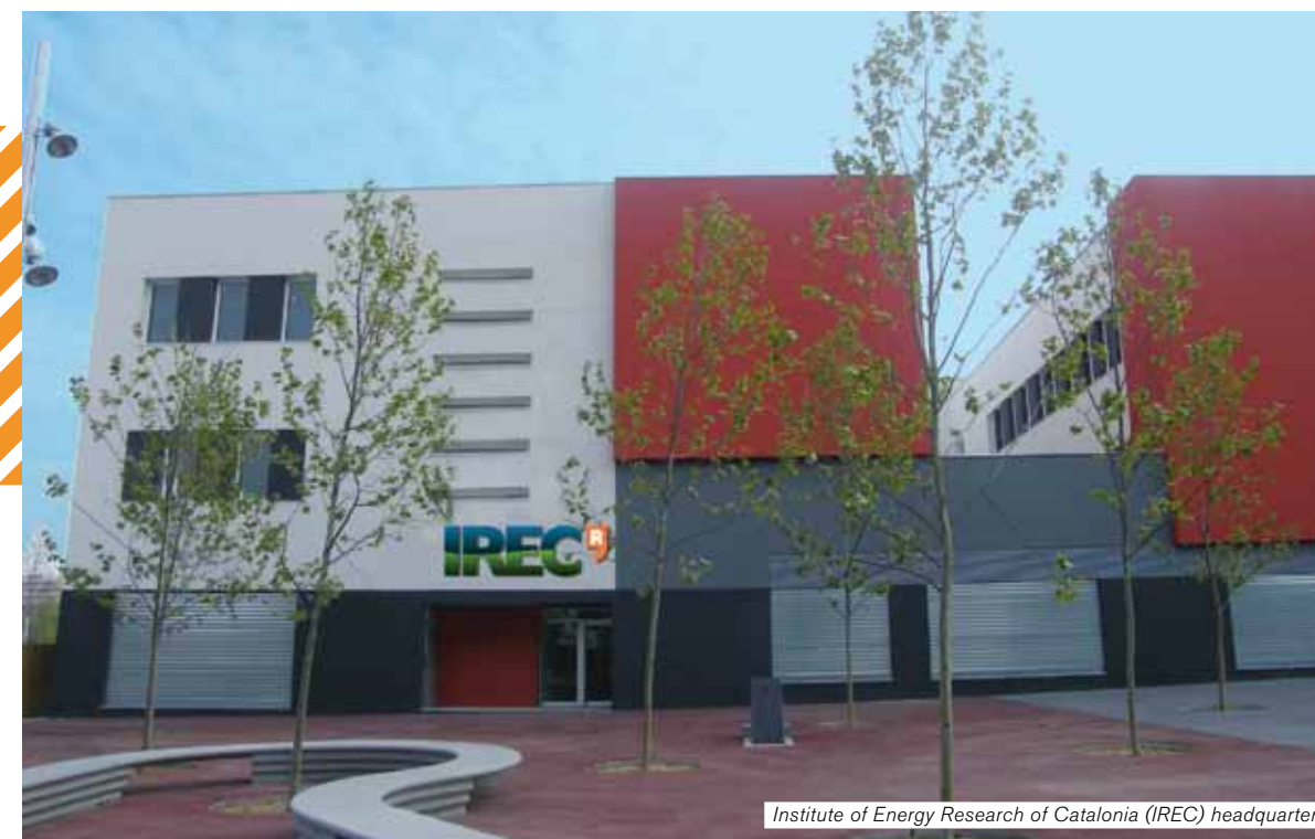
Institute of Energy Research of Catalonia (IREC) headquarters

- Institute of Energy Research of Catalonia (IREC): Was established in 2008 with the goal of becoming a centre of excellence in the field of energy efficiency.