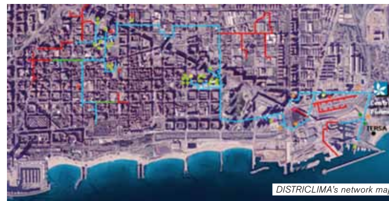
DISTRICLIMA's network map

- Combined cycle groups: the three nuclear groups currently operating in Catalonia are going through a process of gradual replacement based on conventional power stations. Among these, the most appropriate technology is fuelled with combined cycle natural gas, which has a low-environmental impact, because it is highly efficient. In Catalonia, there are currently eight